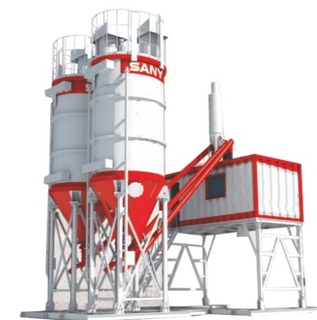
CONCRETE BATCHING PLANTS