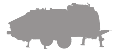
Stationary Concrete Pumps

SANY is the Global leader in concrete machinery manufacturing. SANY offers full range of concrete machinery from concrete batching plants, truck mixers, Stationary Concrete Pumps, Truck-mounted Concrete Pumps, Placing Booms etc. SANY concrete machinery offers reliable performance, wide adaptability, easy operation, high efficiency and lower maintenance cost.