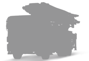
Truck-mounted Concrete Pumps